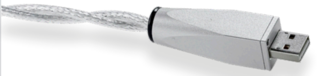
FUTURE DREAM 22 USB