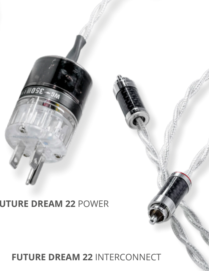
FUTURE DREAM 22 POWER